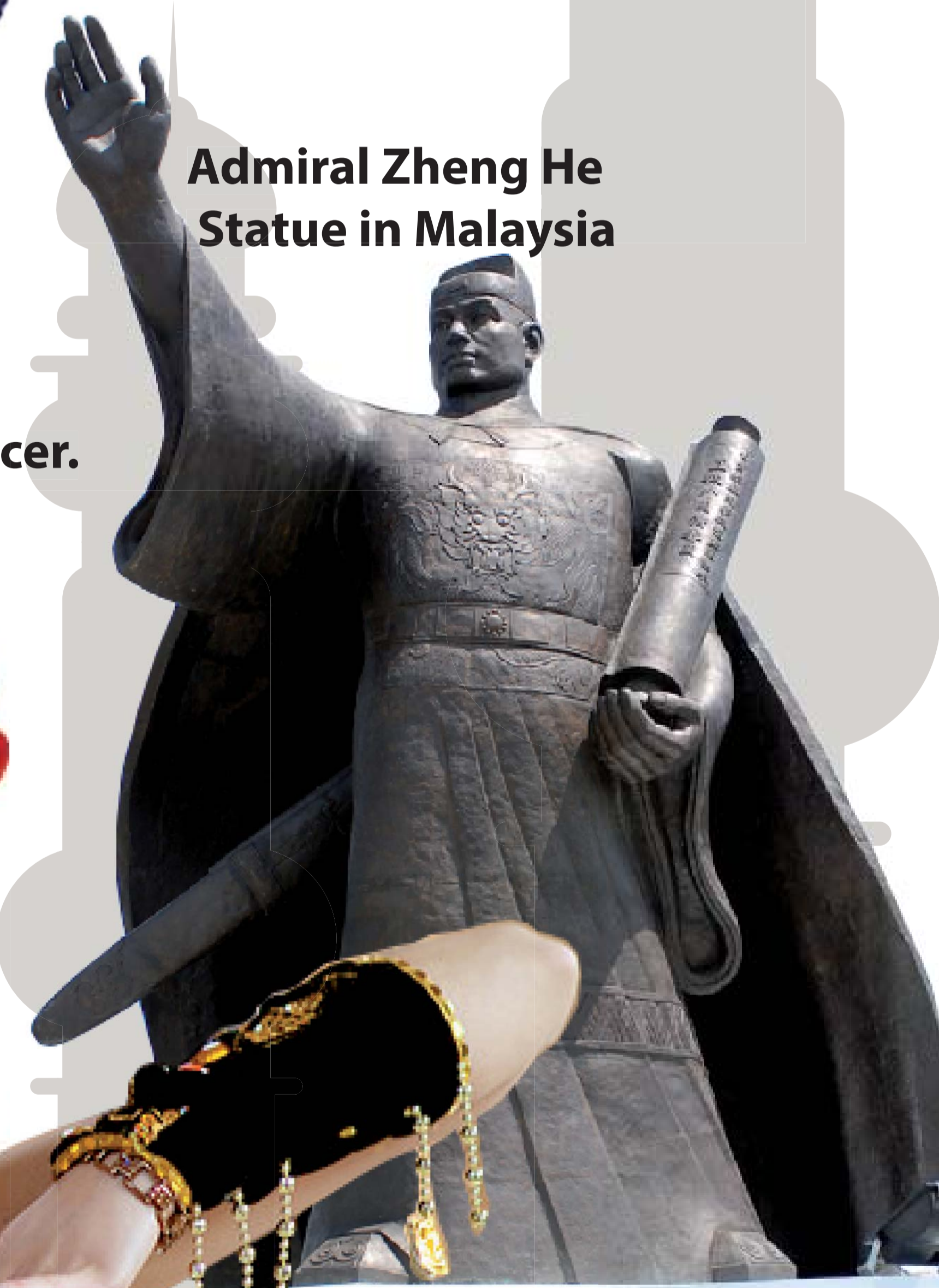
Admiral Zheng He Statue in Malaysia